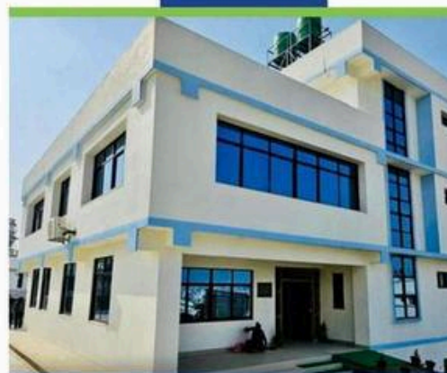
OPERATIONS BEGIN IN THE CLINICAL AND RESEARCH BUILDING

This building is a vital step, empowering our research team and initiating OPD services while our main hospital is under construction. Your support fuels progress, and we're grateful for every step forward!